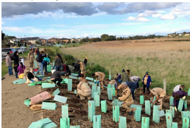
Creek Waters Close was the last site to be planted on the day.