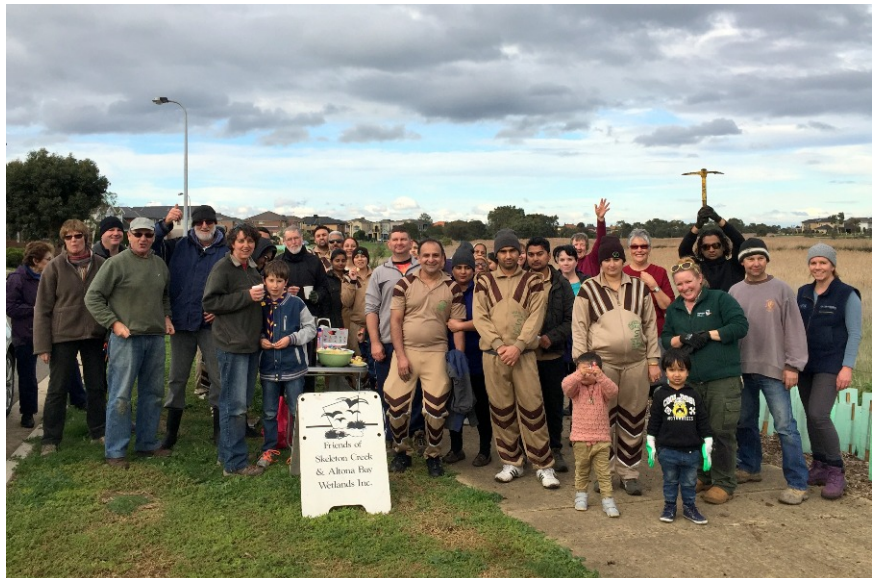
We had a bumper crowd of volunteers for our alternative National Tree Day planting at Markham Way/Creek Waters Close, Altona Meadows, Sunday 24th July.

Thanks to having so many of our Dera Sacha Sauda volunteers and local volunteers meant we were finished by 2:45 pm and ready for our afternoon tea.